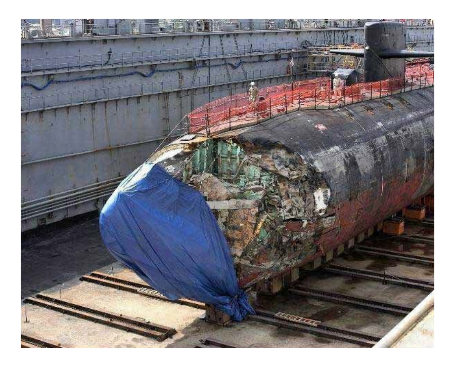
Figure 21.1 Many seamounts remain uncharted. On January 8th 2005, the US nuclear submarine San Francisco en route to Brisbane Australia for a port visit, ran into an underwater mountain at 35 knots about 350 miles south of Guam leaving one sailor dead: a number of sailors were awarded medals for bravery in dealing with over 70 wounded. The seamount is now named the "San Francisco seamount".